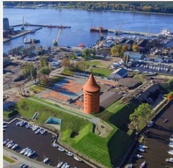
THE CASTLE MUSEUM

Melnrage papludimys. My top places are closed by this beach. If you are tired of the city bustle and want to go on a retreat, then you should definitely go to this beach. It is beautiful both in summer and in winter, where you can enjoy the silence and relax a little.