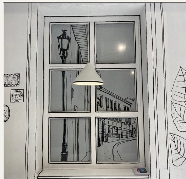
MUSEUM OF ILLUSION

All these places are located in the center, which allows you to quickly get from one to another. I wish everyone a good time, and do not forget to take your ISIC for generous