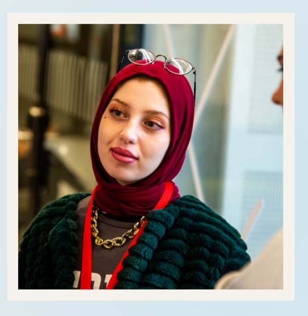
4 years/240 ECTS 3727 Eur/year

Mathematics * 0.4 + English *0,3 + motivation letter * 0,3