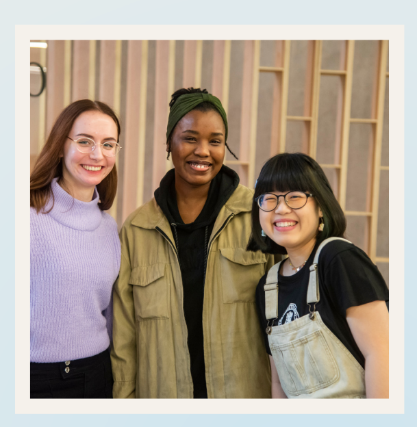
2 years/120 ECTS 4295 Eur/year

Motivation letter*0,5 + Grade Point Average of study subjects *0,3 + Grade of Final Thesis (Exam)*0,2