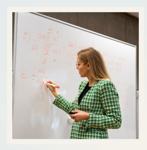
4 years/240 ECTS 3727 Eur/year

study motivation letter * 0,2 + grade point average (of school graduation certificate) * 0,4 + examination/term grade of English language * 0,4.