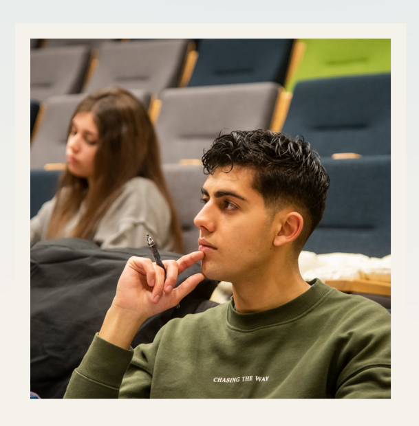
1,5 years/90 ECTS 4295 Eur/year

Grade Point Average of study subjects*0.6 + Grade of the final thesis of bachelor studies*0.3 + Motivation letter*0.1