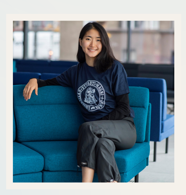
4 years/240 ECTS 8244 Eur/year

Admission examination - Admission examination - personal performance video record for not less than 5 min.