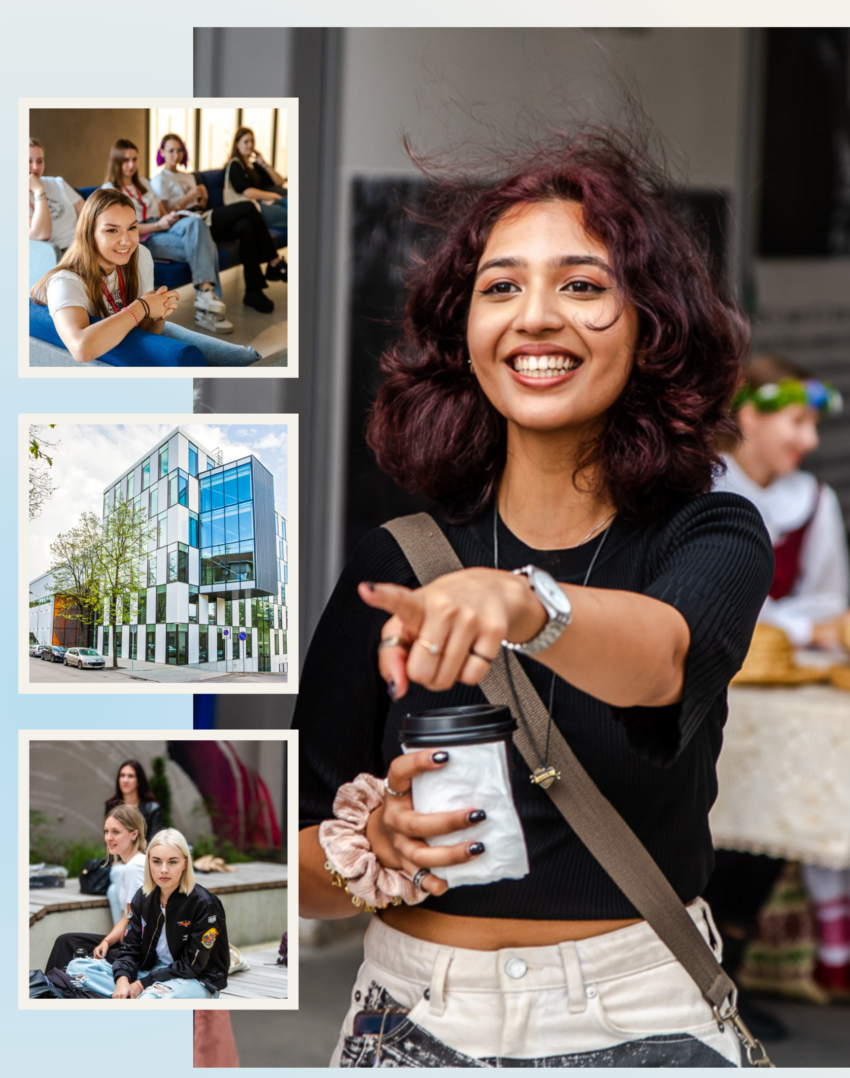
Vytautas Magnus University students