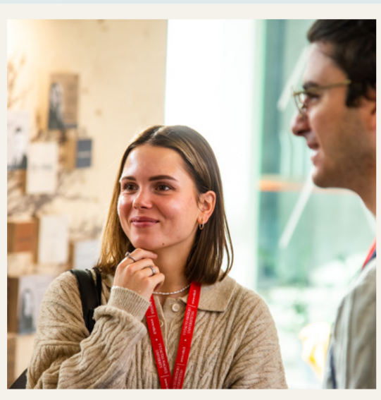
4 years/240 ECTS 2865 Eur/year

Motivation letter * 0.3 + History * 0.3 + English * 0.2 + Mathematics + 0.1 + Geography + 0.1