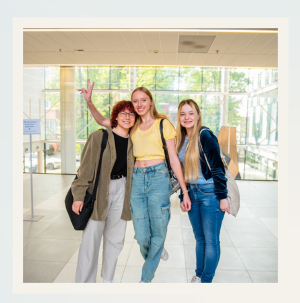
3,5 years/210 ECTS 2865 Eur/year

Mathematics * 0.4 + English * 0.4 + Motivation letter/Interview * 0.2