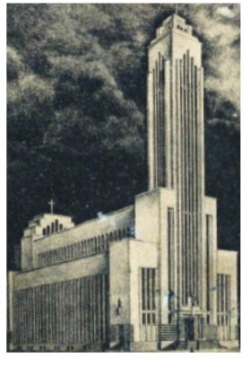
Figure 7. The Christ's Resurrection Church in Kaunas [39].