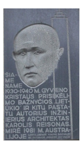
Figure 10. Memorial plaque to K. Reisonas in the Kauna city (arh. L. Strjoga ) [43].

Not only the buildings and drawings that have survived to this day, but also the memorial plaques, which were erected in Kaunas and Šiauliai cities, show and remind of K. Reisonas' life and work. His works are mentioned in the history of architecture, at photo exhibitions, seminars and conferences. Exhaustive information and visual material on valuable architectural buildings are available in the database of the Register of Immovable Cultural Valuables of the Republic of Lithuania.