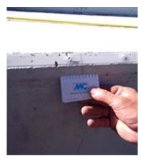
Figure 2. The illustration of crack width measurement using the crack width ruler

In accordance with European Standard EN 13791:2007 "Assessment of in-situ compressive strength in structures and precast concrete components" and European Standard EN 206:2017 "Concrete - Specification, performance, production and conformity" based on the concrete compressive strength, determined using non-destructive method, the characteristic strength of concrete was determined guaranteed with the probability of 95 % and the class of compressive strength of concrete was selected.