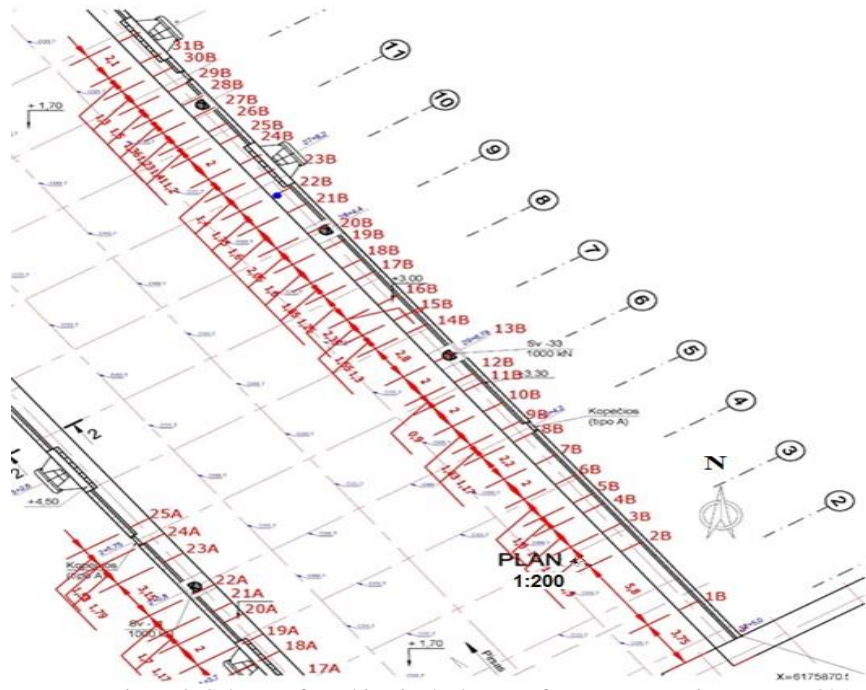
Figure 3. Scheme of cracking in the beams of superstructure in quay No. 80A

After the examination of concrete beams of the superstructure in quay No. 80A on the 13th of august, 2012, the vertical cracks were noticed every 0.9-5.8 m (Fig. 3).